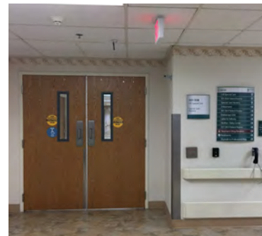
OB Special Care