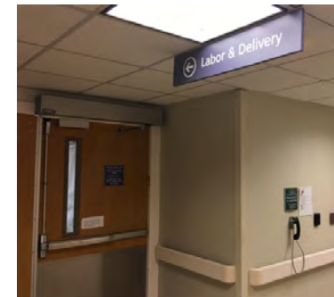
Labor & Delivery